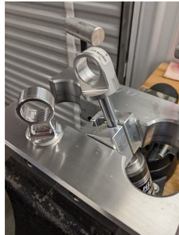
Figure 1.0 – Walker Evans shock ready for eyelet removal.